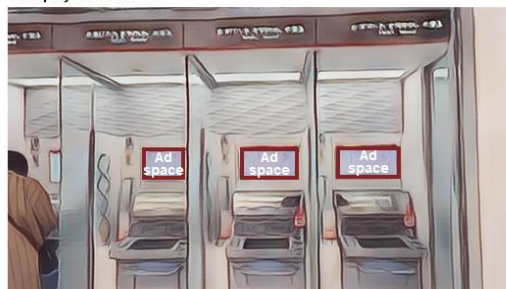
▼ Display above ATMs